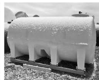
Sump Bottom Transport Tank 3,200 gal. on frame