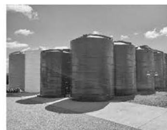
Flat Bottom Storage Tanks 1,000 gal. – 10,000 gal. 10-year warranty White, Green, Black available