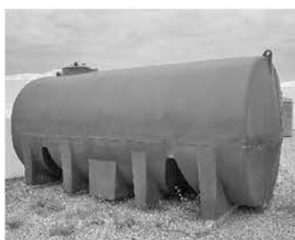
Freestanding Transport Tank 1,000 gal. to 4,500 gal.