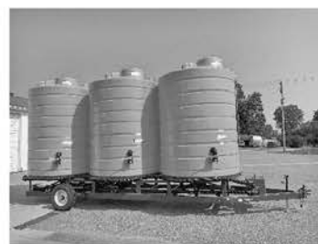
Triple Cone Trailer 3 x 3,000 gal. cone bottom, lights, Honda 3" plumbing, recirculation