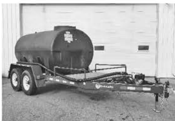
1,200 gal. DOT Nurse Trailer LD Hwy. tires, 4 ft. deck, lights, brakes fenders, Honda 2" plumbing