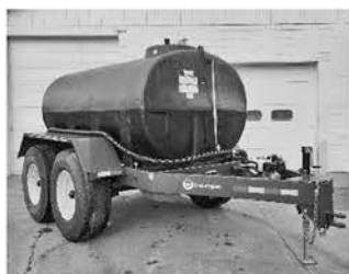
1,600 gal. Ag Nurse Trailer Flotation tires, lights, brakes, fenders, Honda 2" plumbing