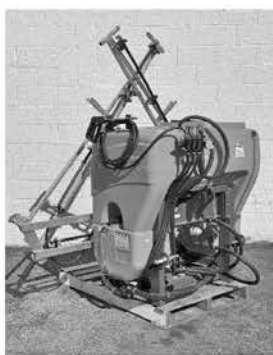
100 gal. Land Champ 3 pt. tractor sprayer, cast iron pump, manual controls, multiple boom options