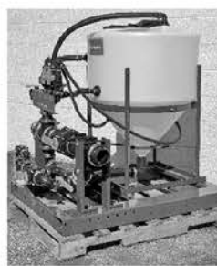
Swift Blender Chemical Handling System