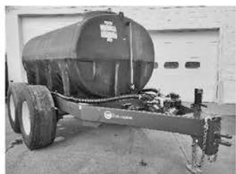
1,600 gal. Ag Nurse Trailer Flotation tires, lights, brakes Honda 2" plumbing