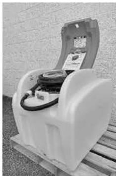
DEF Fuel Boss 75 gal. & 100 gal. with 12V pump