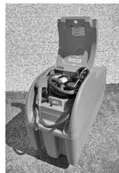
Diesel Fuel Boss 75 gal. with 12V pump