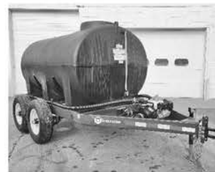
1,200 gal. Ag Nurse Trailer Ag wheels, clevis hitch, Honda 2" plumbing